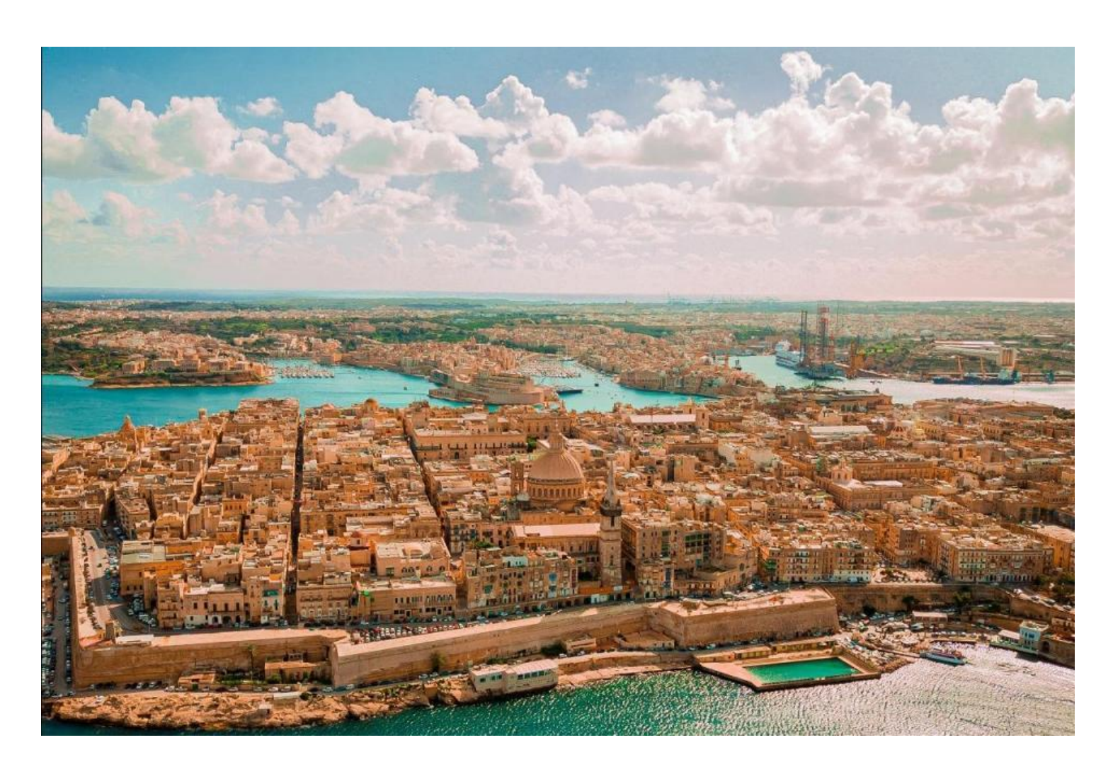
Aerial View of Valletta and the Three Cities