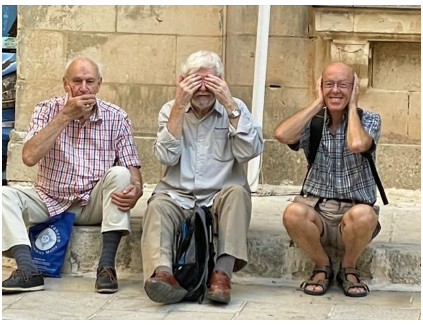
Committee members in Mdina

Waiting for the women to come out of the shop