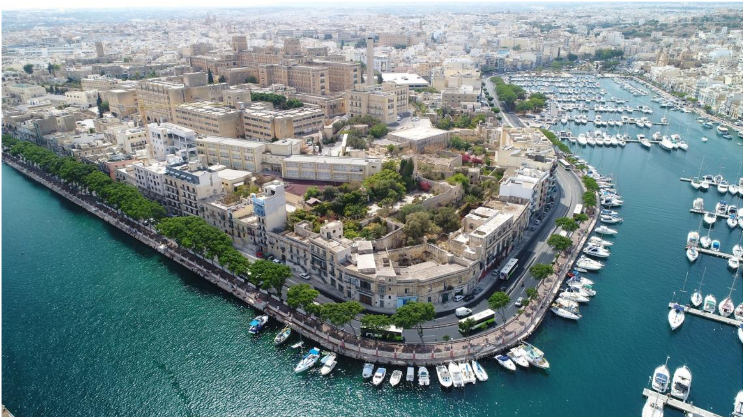
View of Pieta showing the Garden of the Villa Frere